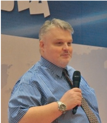
Executive Director XLProjects (XLP)

I have some good news for you. No, strike that. I have some great news for you!