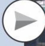
40' FR with collapsible ends (Heavy Duty & High Cube)