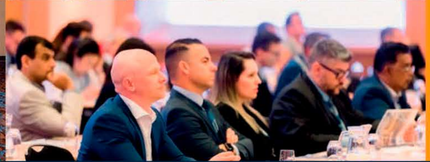
Logline's participation in the main international market events.