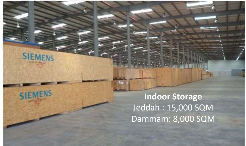
Indoor Storage Jeddah : 15,000 SQM Dammam: 8,000 SQM