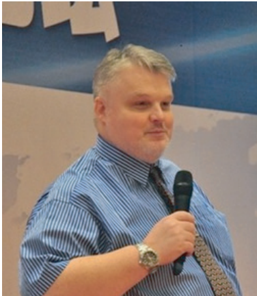
Executive Director XLProjects (XLP)

I have some good news for you. No, strike that. I have some great news for you!